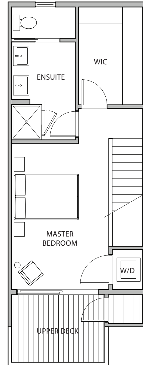
Liveable: 405 sq ft Amenity: 87 sq ft